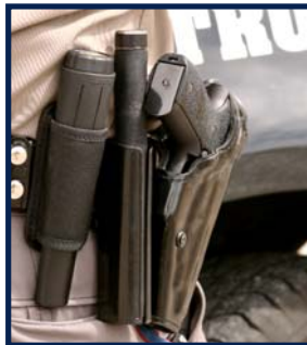
Ballistic weave holster (included) mounts easily on belt or in patrol car